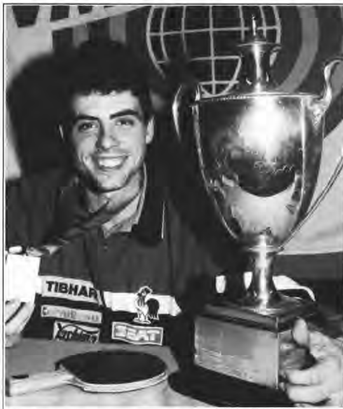
New Mens Singles Champion of the World Jean Philippe Gatien