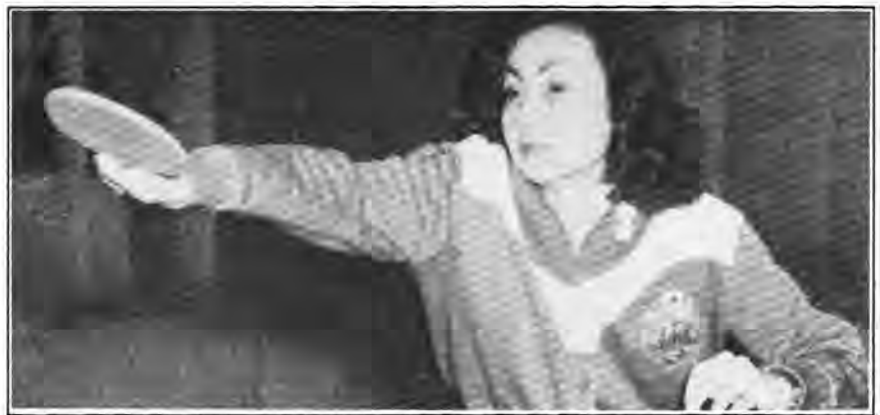
Pictured above is Angelica Rozeanu and below is Ichiro Ogimura

Angelica Rozeanu won six world singles titles in consecutive years, a record that is unlikely to be beaten by man or woman and in addition she won three women's doubles and three mixed doubles titles. Her achievements for Rumania were of special significance as she was the star of its team that won the Corbillon Cup on five separate occasions. She holds the highest Rumanian sports distinction - the coveted title of 'Merited Master of Sport'. Angelica has now left Rumania and lives in Israel; her mere presence in that country will give much impetus to the sport