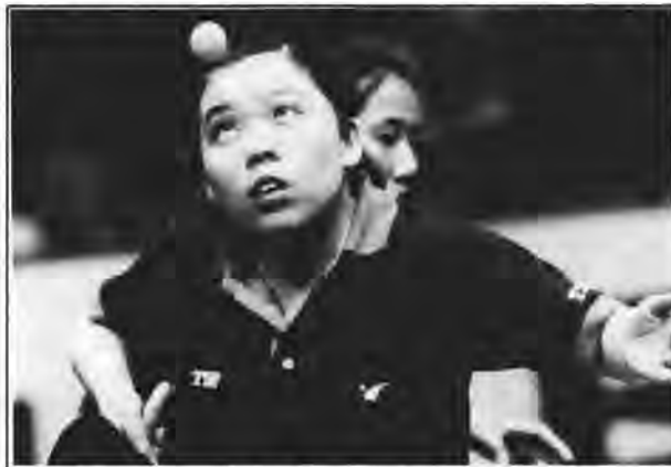
Deng Yaping World No. 1